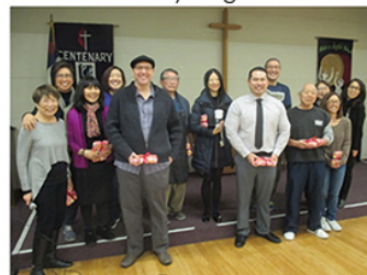
Wise Up Program Leaders