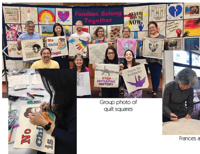
Group photo of quilt squares