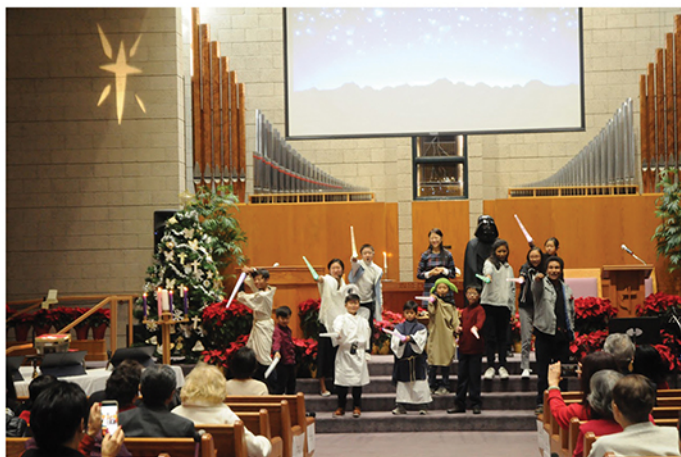
The kids' program was Star Trip - Our Faith Awakening