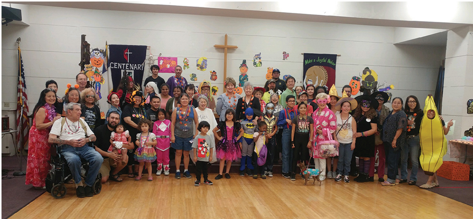
Photograph from Halloween party on Sat Oct 27, 2018