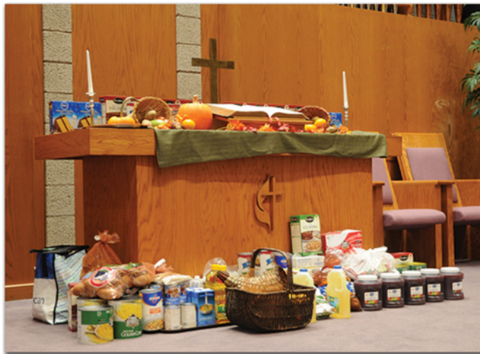
Thank you for your donations and support for this year's Annual Turkey Dinner Mission Project.